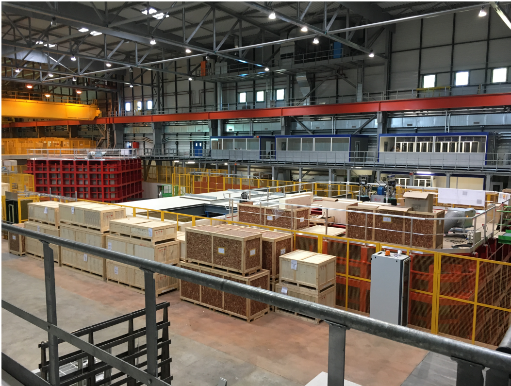
View of the CERN North Hall extension with the two ProtoDUNE cryostats now under construction. Some of the many boxes containing insulation and membrane cryostat parts are also visible.

Overall, the Committee was very impressed by the significant progress achieved by both LBNF and DUNE since the last LBNC review. Of particular note are the steps taken by LBNF towards awarding the critical CM/GC and related contracts. Funding limitations and short-term limitations on delivery of funding are the primary constraint at the moment for moving forward. Equally impressive is the successful start of cryogenic operations with the WA105 1x1x3 prototype, and the progress in constructing the two protoDUNE cryostats by CERN and GTT. The LBNC site visit to CERN was particularly useful for the committee to get a firsthand impression of these impressive efforts.