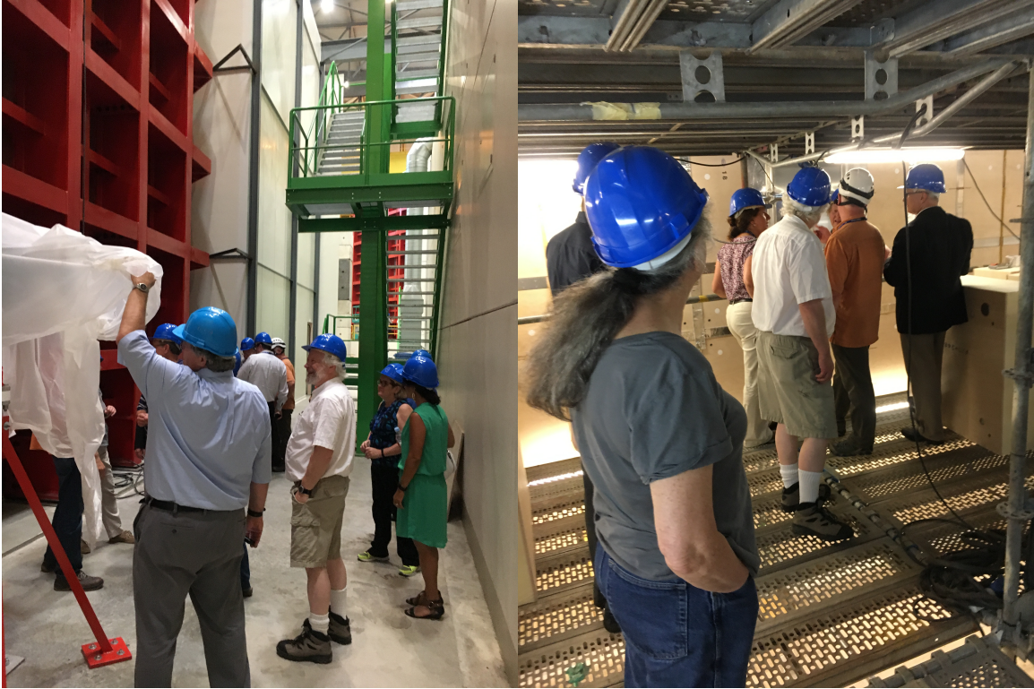
View of the exterior of the ProtoDUNE-SP cryostat looking back towards the ProtoDUNE-DP cryostat in the distance (left); view of scaffolding and insulation installation in the ProtoDUNE-SP cryostat (right).