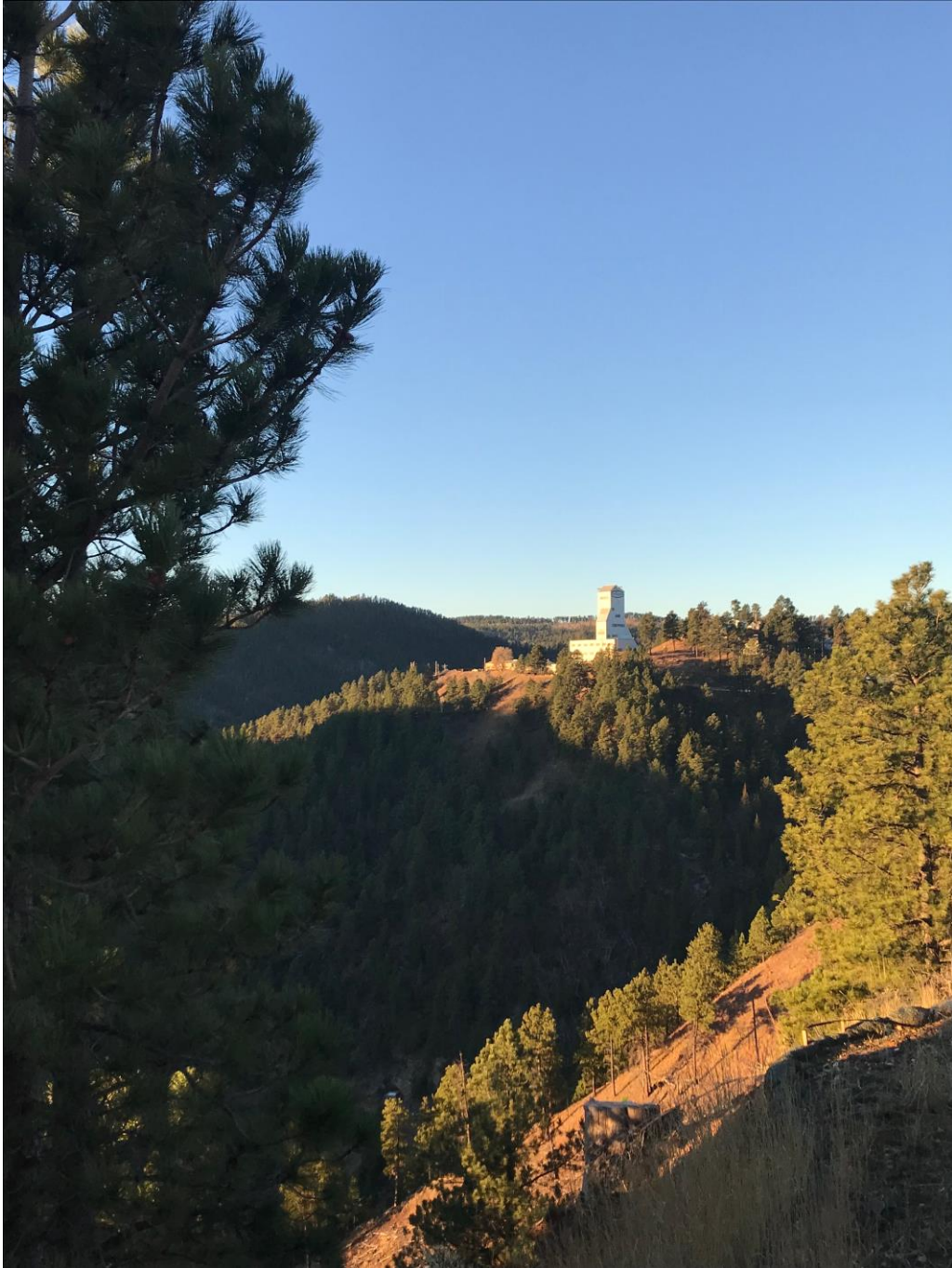
View towards the Ross hoist through the beautiful Black Hills countryside