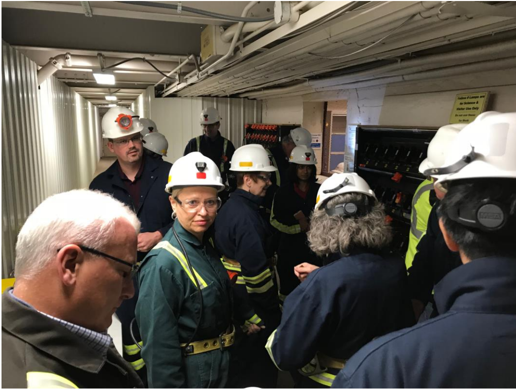
Donning all the proper PPE for going underground