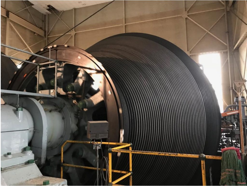
Inner workings of the Yates hoist in action