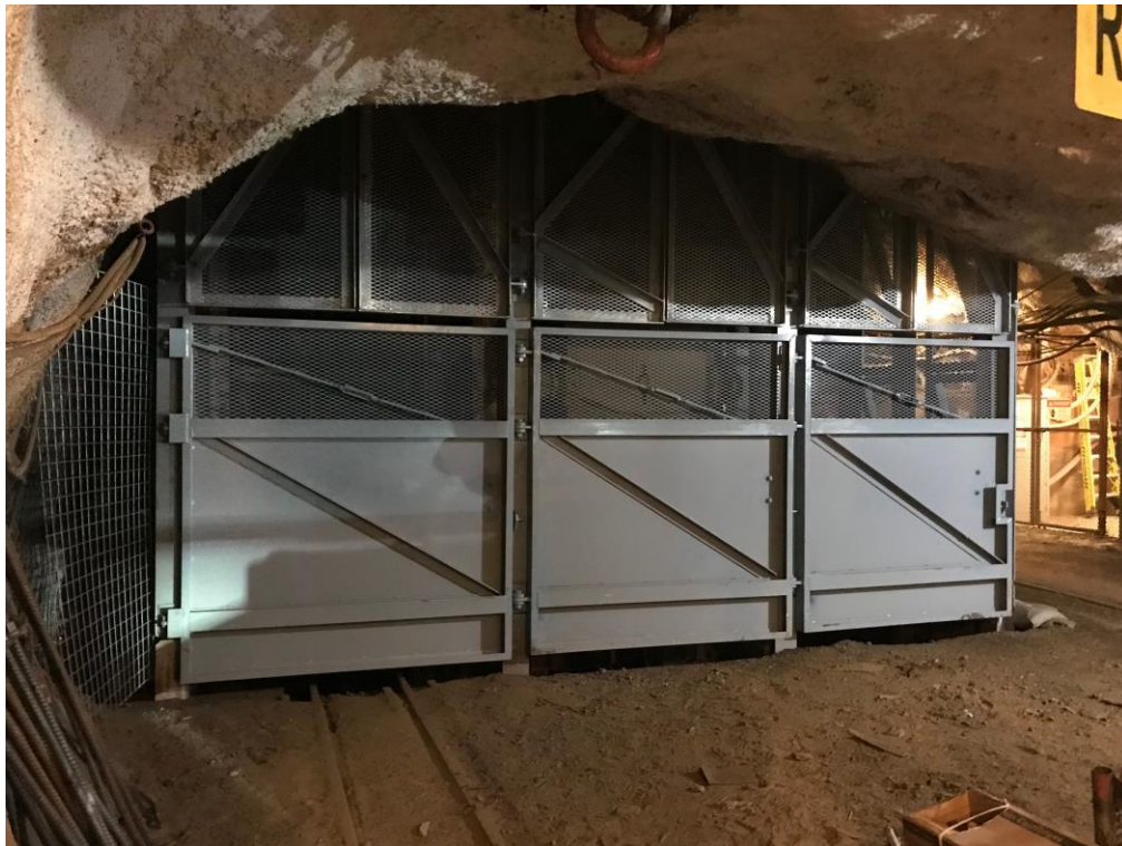
Witnessing the important milestone: completion of the Ross shaft refurbishment to the 4850L